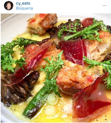
@cy_eats Followers: 50.2K Likes: 1,220 Comments: 25