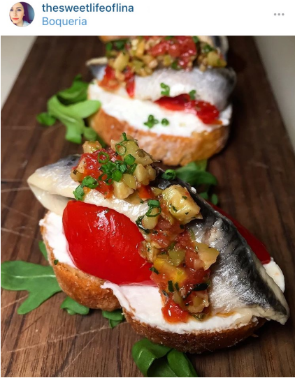
@thesweetlifeoflina Followers: 36.2K Likes: 1,030 Comments: 15