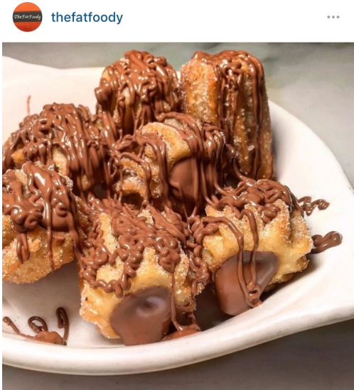
@thefatfoody (regrammed @thesweetlifeoflina) Followers: 22K Likes: 416 Comments: 14