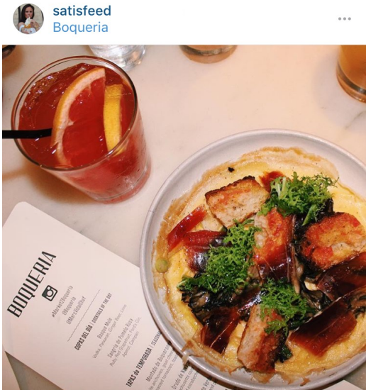
@satisfeed Followers: 20.6K Likes: 398 Comments: 5